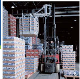
分层拣货器 Layer Pickers

配送机构可从分层拣货器带来的速度和多用途性中受益。在堆放混合型货物堆垛时，分层拣货器可搬运单层或多层的听装和瓶装产品。卡斯卡特多用途分层拣货器为您节省人力成本。