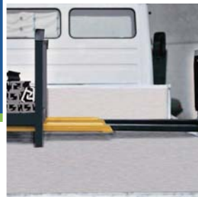
前移叉 Telescopic Forks

伸缩叉架让你具备推出货物的灵活性，这使得在货车单侧进行装卸货变成了可能。它可以结合货叉、调距叉或其它夹类产品一起使用以适应您的特殊工况。The Load Extender allows you the flexibility to push the load making it possible to load/unload from one side of a truck. It can be used in combination with forks, fork positioners or other clamps in order to accommodate your specific application.