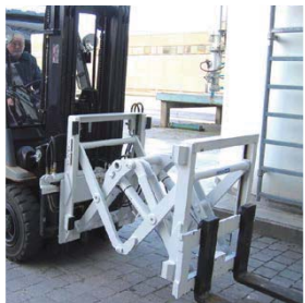
伸缩叉架 Load Extenders

Distribution facilities can benefit from the speed and versatility the Layer Picker offers. When building mixed-load pallets, the Cascade Layer Picker handles single layers or multiple layers of both canned & bottled product. Replace costly manual labor with the versatile Cascade Layer Picker.